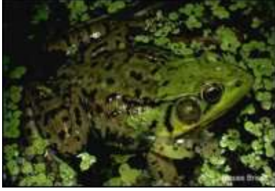
Leopard Frog ( Rana pipiens )