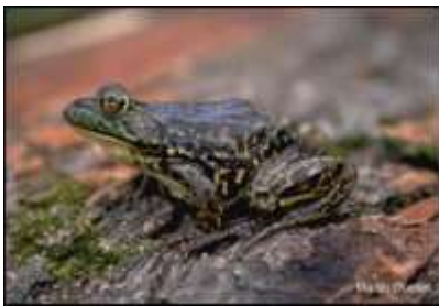
Pickerel Frog ( Rana palustris )