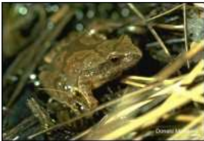
Wood Frog ( Rana sylvatica )