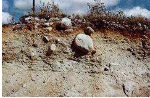
Figure 11.9 Glacial till exposed in a moraine; a typical parent material for soils in the central United States.

The C horizon represents the soil parent material, either created in situ or transported into its present location. Beneath the C horizon lies bedrock.